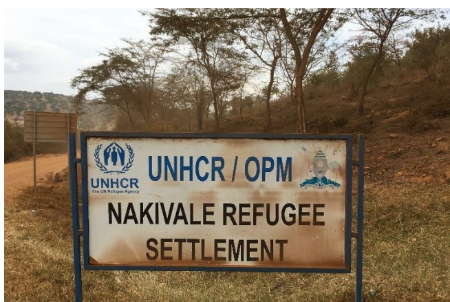
Signpost at the entrance of Nakivale Refugee Settlement

On 1 August 2017, IRRI wrote a letter with a summary of its findings and questions to UNHCR, the Ugandan Commissioner of Refugees at the Office of the Prime Minister (OPM) and the Burundian Ministry of Interior and Patriotic Education. Only OPM responded and these responses are integrated in the report. IRRI would like to thank OPM for responding to the letter and for granting access to the refugee settlement. IRRI also spoke to several humanitarian workers in Nakivale and would like to thank them for helping to facilitate the research.