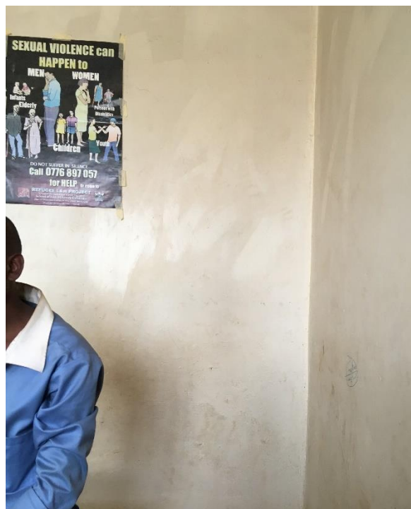
A Burundian refugee below a poster about sexual violence

The other man said: “There is insecurity here, because there are Imbonerakure who come here. I informed the authorities [in Nakivale settlement] about it, but no protection measure has been put in place. I recognised two of them, I knew them from Burundi.” 93 Despite a request, UNHCR