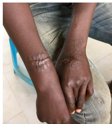
A Burundian refugee shows his torture scars

An FNL member reported that SNR officers beat him during arbitrary detention in their detention centre in Ngozi, using batons with barbed wire. He said he was later transferred to